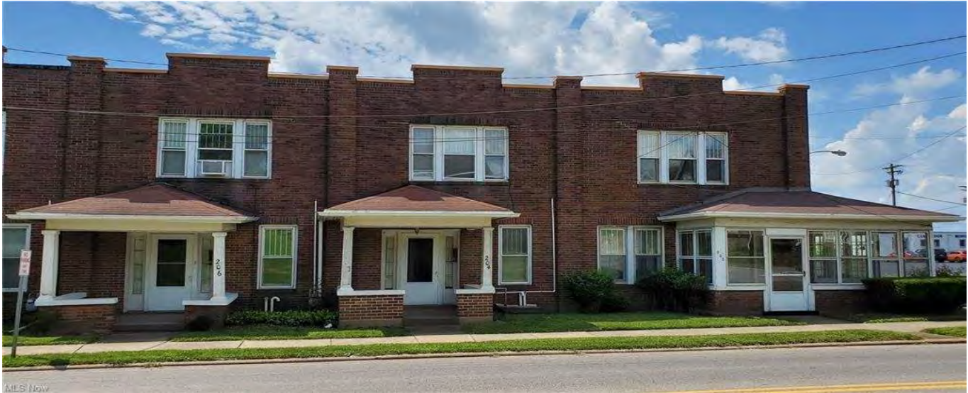
202 S. 11 th Street, Cambridge